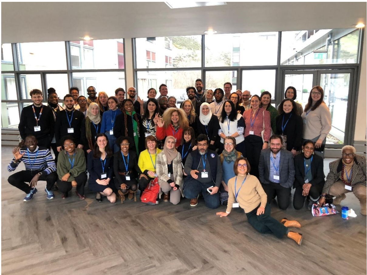
Delegates at the Universities of Sanctuary conference in Edinburgh, 2023