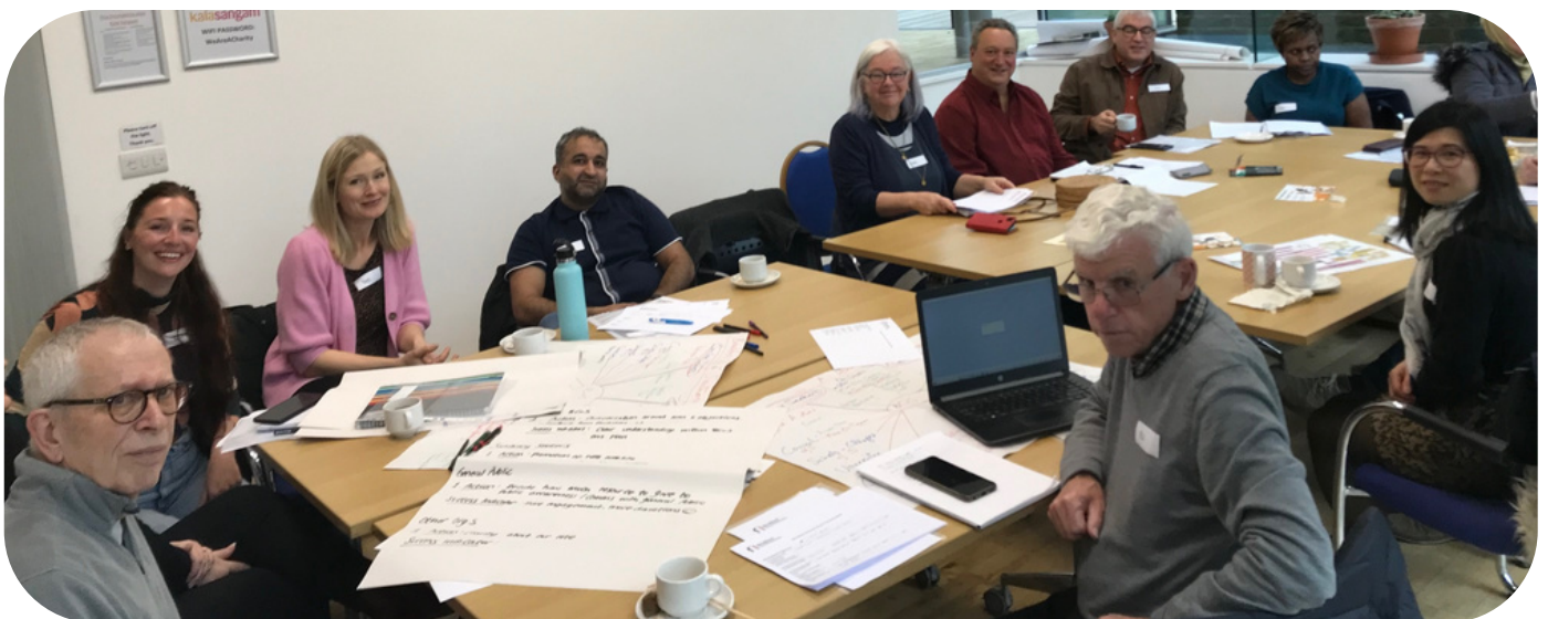
Trustees, Staff and our Advisory group at our Annual Planning day in February.

In the coming year this group will be a key driver in our development. We are really excited to see how it develops and to learn from the experience of those with lived experience of seeking sanctuary."