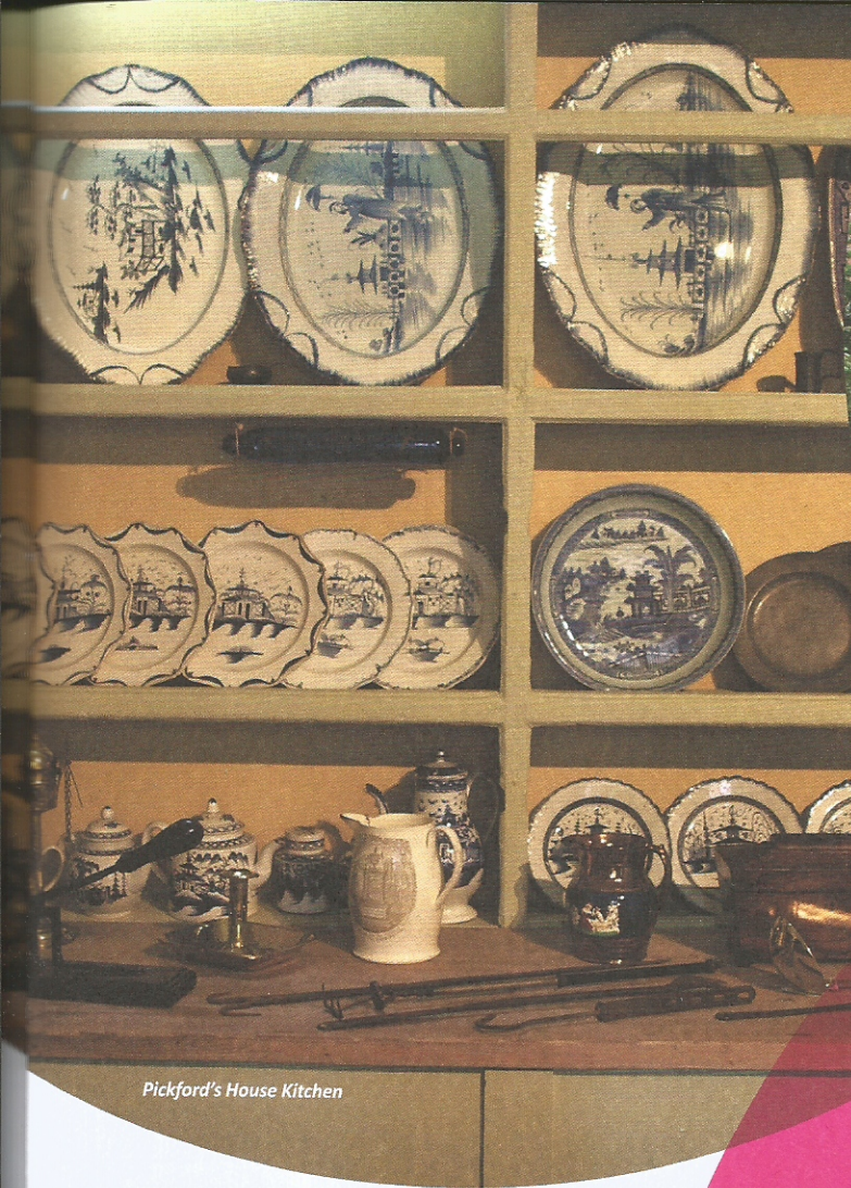
Pickford's House Kitchen