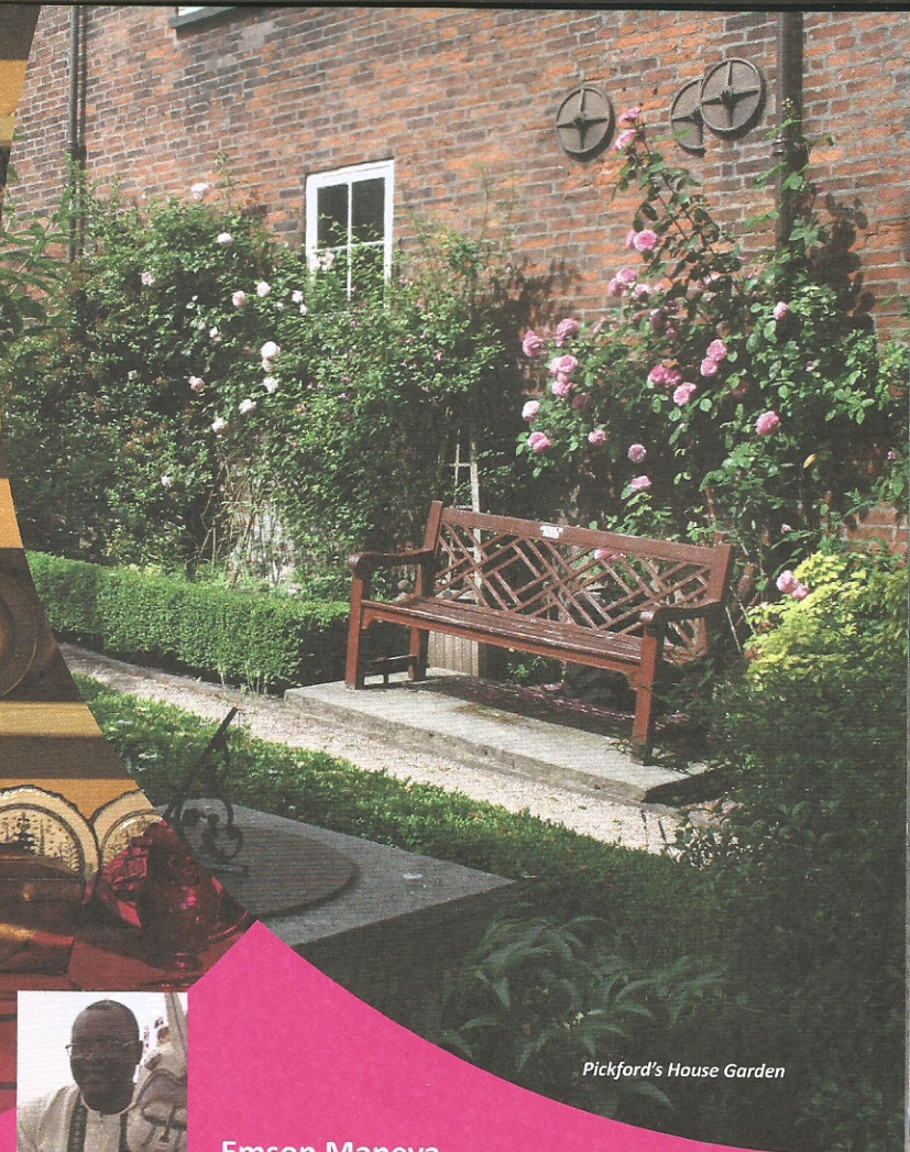
Pickford's House Garden