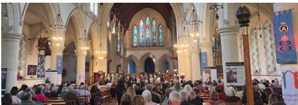
Sing for Sanctuary event held at St. Mary's Church