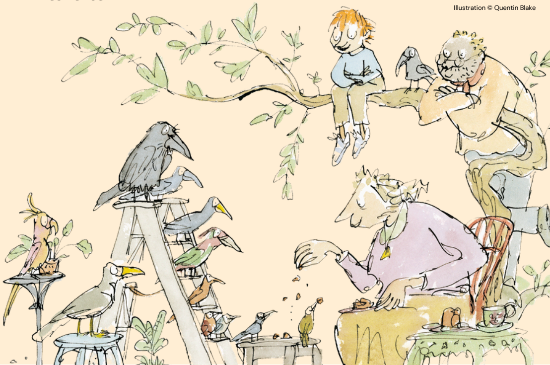
Illustration © Quentin Blake

A photography exhibition exploring what courage means to members of the UEA University of Sanctuary community. The project captures stories, identities and experiences connected to sanctuary, belonging and resilience.