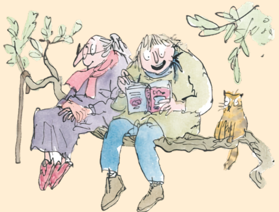
Illustration © Quentin Blake

This initiative is a proud collaboration between Norwich Tales and Trails and Norfolk County Council's REDI Team (who support migrant families and lead the Schools of Sanctuary project).