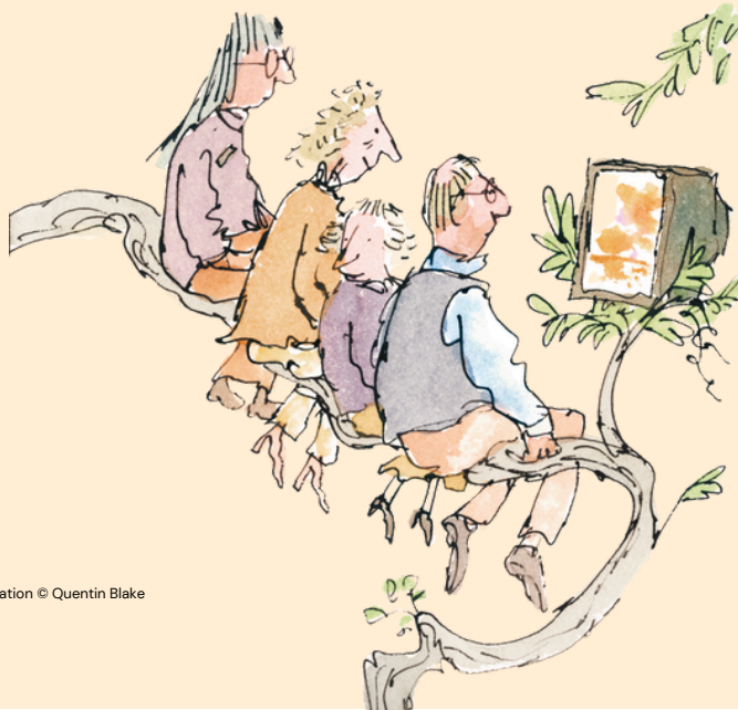
Illustration © Quentin Blake