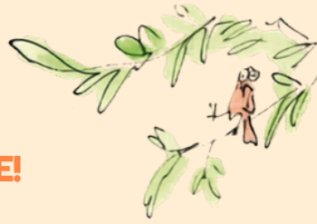
Illustration © Quentin Blake