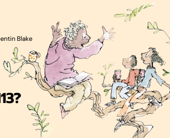
Illustration © Quentin Blake

SEE EVENTBRITE FOR VENUE DETAILS - HTTPS://WWW.EVENTBRITE.CO.UK/E/1989963405113? AFF=ODDTDCREATOR