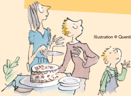
Illustration © Quentin Blake