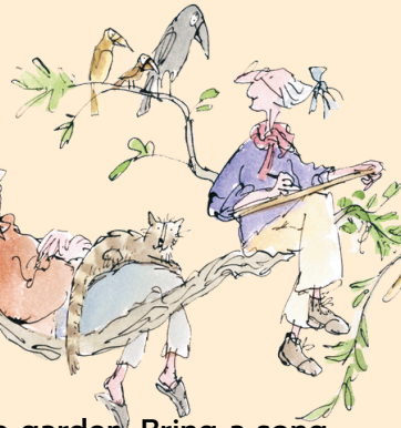
Illustration © Quentin Blake